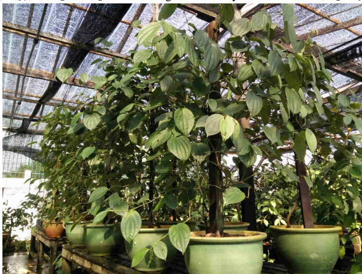
Fig.2: Potted trial used to test the effect of different fertilizer regime on vegetative growth under greenhouse condition

\text{RGR} = (\text{LnW}_2 - \text{LnW}_1) / (T_2 - T_1) ; \text{LnW}_2 - \text{LnW}_1 = Natural logarithm of dry matter variation; T_2 - T_1 = Time variation as day