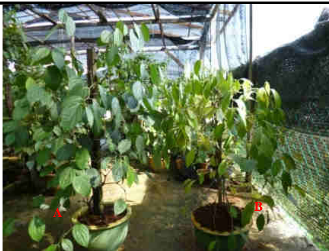
Fig. 3: Effect of different fertilizer treatment on plant physiology

A: plant showed vigorous growth when treated with 50% of NPK + foliar fertilizer at concentration of 5ml/L of water B: plant showed nutrient deficiency symptom when treated with foliar fertilizer only at concentration of 10ml/L of water